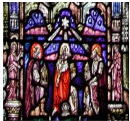
Detail from the Epiphany Window. Young Family Memorial. Willet Studios; Phil., PA. 1951. Western nave wall.

In Jesus, the mystic meaning becomes crystal clear: The Gift of the Sacred One becoming flesh, only to die a painful death, to give us life eternal.