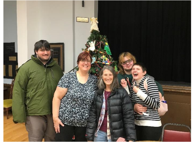
Here are some of those who decorated the Sunday School Christmas tree this year.

If you have someone you would like to add to or remove from our prayer list, please email trinitychurchbaycity@gmail.com or call the office at 989-892-5813.