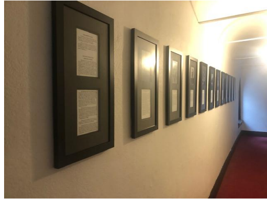
The Bishops' Walk in the ambulatory behind the High Altar and Sanctuary of Trinity Church.